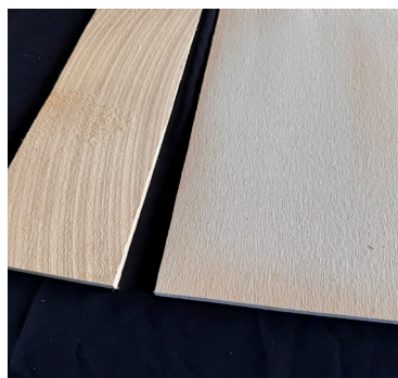
Back shown at left, front shown on the right.