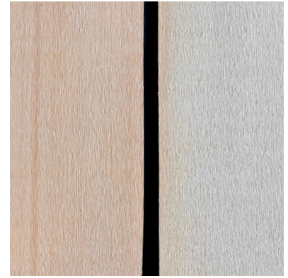
Closeup of 100% clear grain