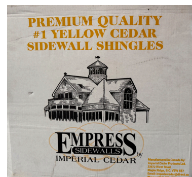
Boxes from Imperial Cedar Products