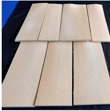
Shingles laid at 14" exposure – requires an undercourse