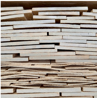
Shingles inside the box