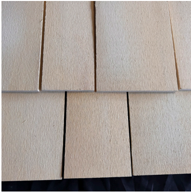
Shingles laid at 7" exposure