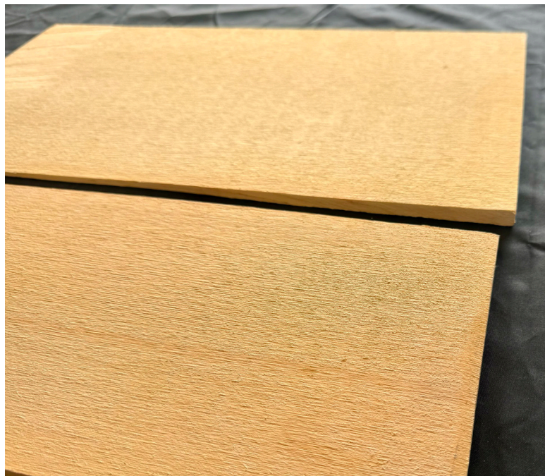
At right: Bleached, 6 months out of the box